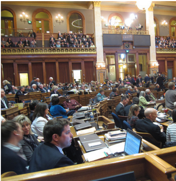
Inside the Iowa House chambers during debate